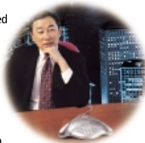
Conduct remote meetings...

If you work in a small to medium-sized business, chances are that you are still using low-quality, handset speakerphones to conduct important business with co-workers, and even customers. Handset speakerphones are fine for listening to voicemail or conducting short conversations, but usually fail to maintain natural two-way communication necessary to maximize productivity and conduct effect business meetings.